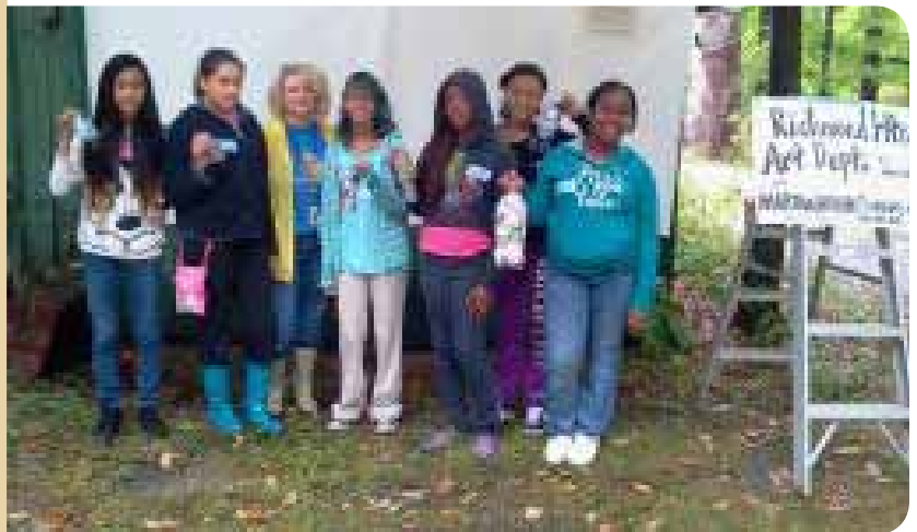
Six Richmond Heights Secondary Art Students grades 7-12 pose with their art teacher in front of a mural they are designing about renewable energy sources.