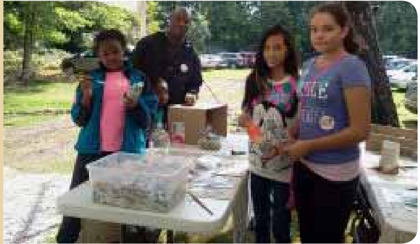
Two Richmond Heights elementary students and their father visit the Richmond Heights Secondary School Art Booth at the 5 th Annual Richmond Heights Fall Festival.

Six Richmond Heights Secondary Art Students volunteered to run a craft booth on a rainy Saturday at the 5 th Annual Richmond Heights Fall Festival held at the historic Greenwood Farm in Richmond Heights. Students helped children paint recycled water bottles with recycled papers and turned the bottles into spinning wind socks to learn about renewable sources of energy. The students also exhibited a mural they are designing about renewable energy sources that will be completed with paints and recycled bottle caps during their art classes in Fall term. The mural project was created by their art teacher, Mary Nichols Brondfield, with a mini-grant funded by the Martha Holden Jennings Foundation that she developed after attending the Flip Your World! innovation conference in April that was co-hosted by the ESC of Cuyahoga County and the Baldwin Wallace Center for Innovation & Growth.