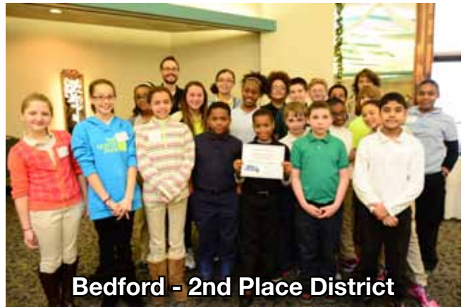
Bedford - 2nd Place District