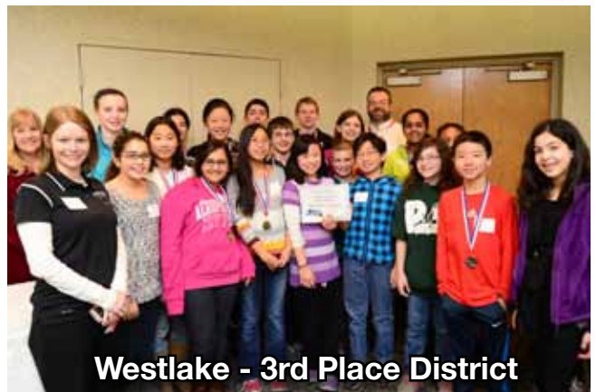
Westlake - 3rd Place District