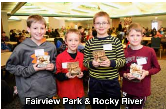
Fairview Park & Rocky River