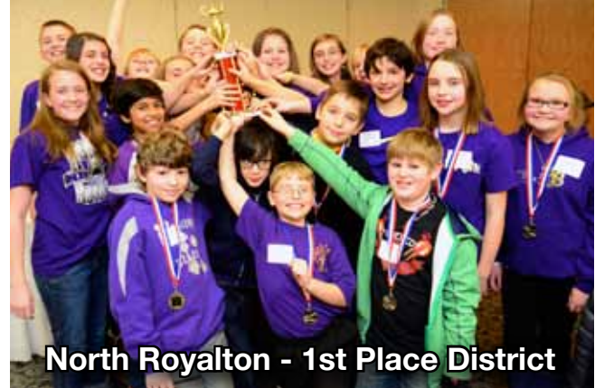
North Royalton - 1st Place District