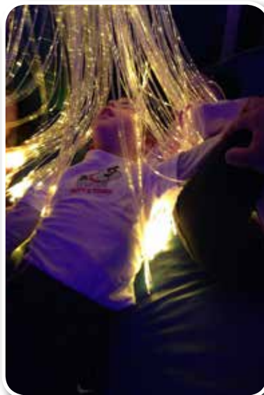
Paxton is enjoying the sensory room that is located at Happy Day School. The sensory room has a light wall, fiber-optics ropes (pictured above), water bubblers, adapted hammock swings, disco lights, and a swinging ladder.