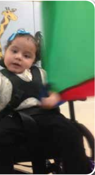
g with a parachute in She is holding on to nd helping the class achute.