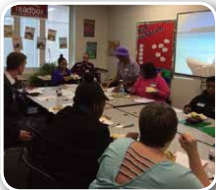
Maple Heights Partnership members discuss ways that Milkovich Middle School can be more welcoming to families visiting the school.