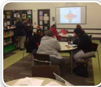
Milkovich Middle School members learning about the PTP model.