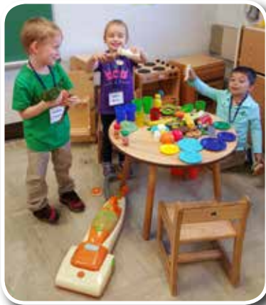
Students engage in pretend and symbolic play at the kitchen center.

The ESC of Cuyahoga County has increased its footprint into Portage County and is currently serving six districts in the area. The ESC provides direct support and supervision of preschool and special education classrooms in three districts. One of our Portage County district partners, James A Garfield , has two full-time preschool classrooms serving students with and without disabilities. Students aged 3-5 explore, investigate, and manipulate their surroundings for a wide variety of learning opportunities. Young children learn through play and the preschool classroom provides the perfect environment for students to acquire new skills. Children enjoy recurring themes and familiar activities and teachers use these to effectively promote learning.