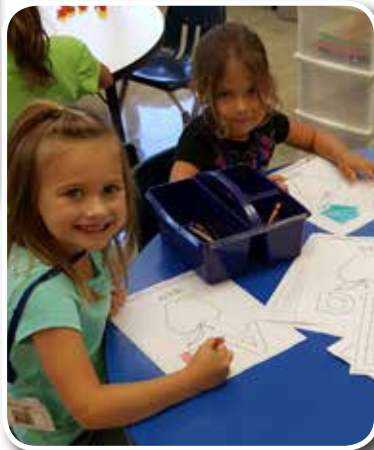
Students color pictures of items that begin with the letter A to reinforce their understanding of the letter sound.