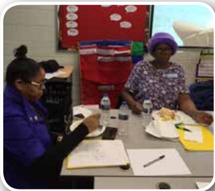
Many families consist of grandparents who are caregivers. An ice-breaker assists members in getting to know one another.