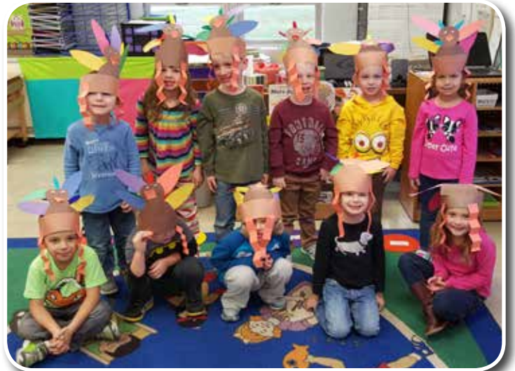
Students create turkey hats as they learn about Thanksgiving.

Students regularly engage in gross motor development through both structured and free play activities.