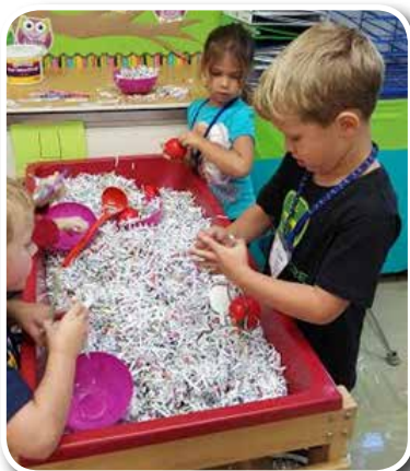
Shredded paper in the sensory table with students' names and pictures to be found as well as other objects to be sorted into bowls.

Students regularly engage in gross motor development through both structured and free play activities.