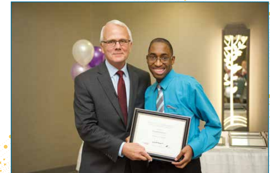
Donald Robinson Richmond Heights Secondary School Richmond Heights Local Schools