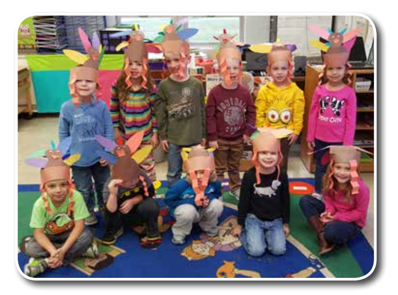
Students create turkey hats as they learn about Thanksgiving.

Students regularly engage in gross motor development through both structured and free play activities.