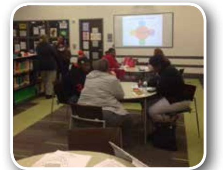
Milkovich Middle School members learning about the PTP model.