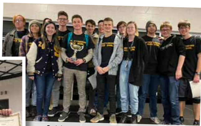
Quiz Bowl 3: Portage League Division 2 Champion - Streetsboro