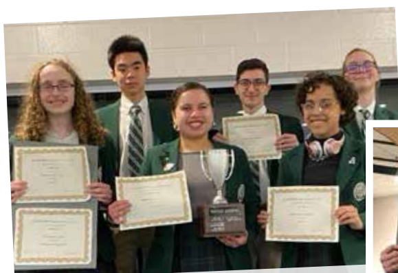
Quiz Bowl 1: Portage League Division 1 Champion - Western Reserve Academy

The Portage League is comprised of 18 school districts including Aurora, Berkshire, Bio-Med, Brunswick, Cloverleaf, Field, Hudson, James A. Garfield, Kenston, Lake Center Christian, Mogadore, Ravenna, Rootstown, Southeast, Waterloo, Western Reserve Academy, and Windham.