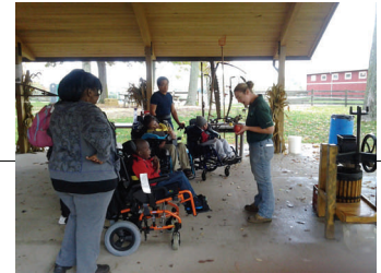
Did you know it takes about 150 small unwanted apples to make 1 gallon of apple cider?