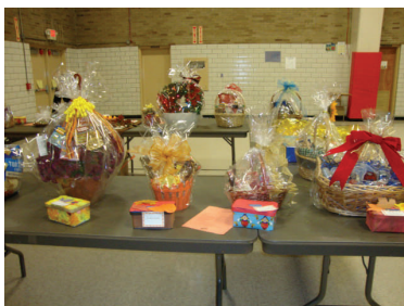
Colorful and beautiful baskets waiting for raffle tickets and 19 winners.